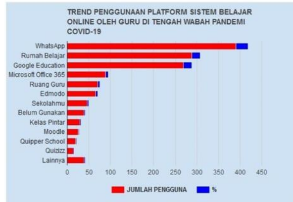
Figure 1 Platform of Learning System

This research was conducted in South Sulawesi, which focuses on Street-Level bureaucracy toward online learning during the Pandemic Covid 19 where population data was 8,342,200 with a 95.63% percentage.